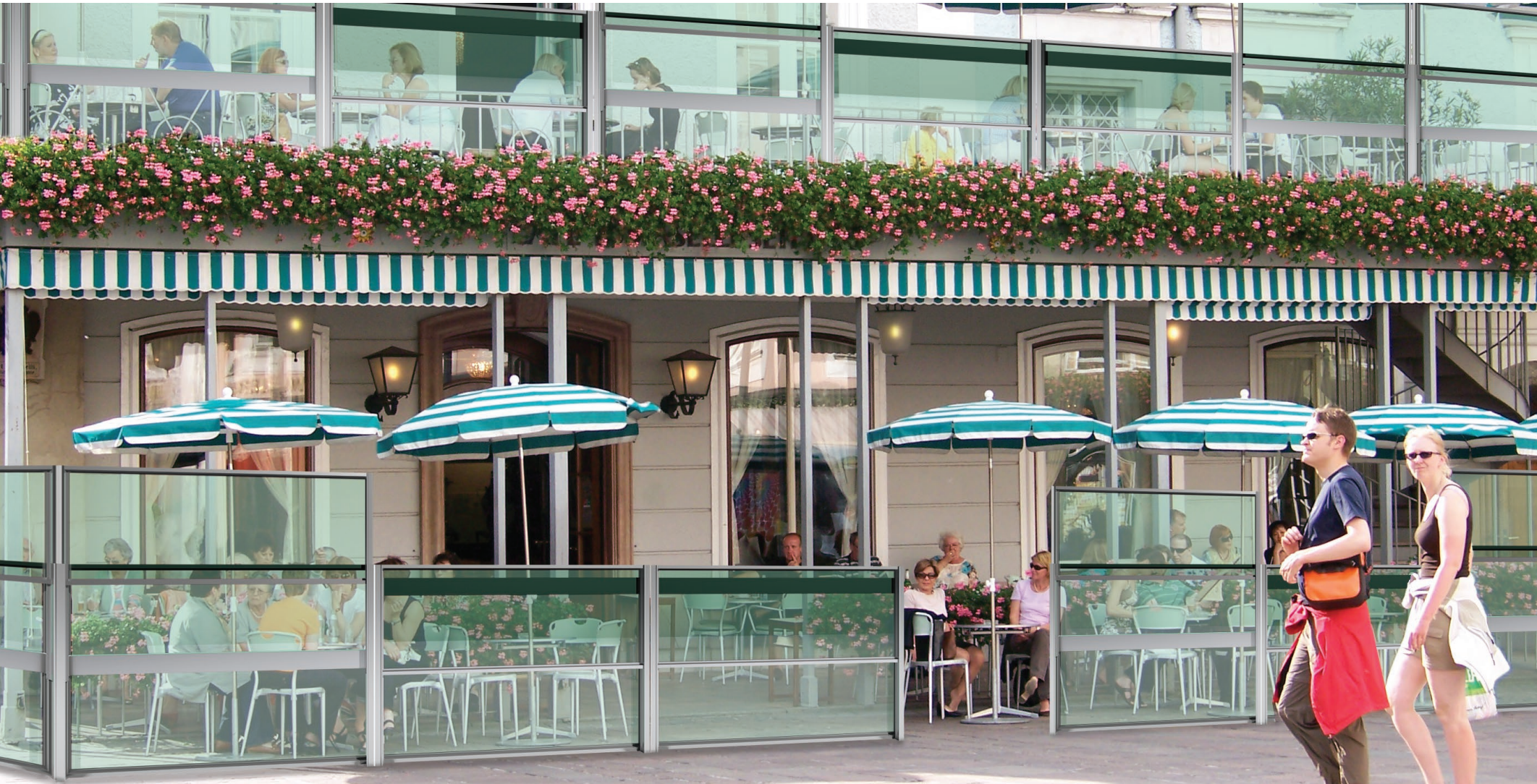
Height Adjustable Glass Balustrade

It is an ambitious product which is enough to create revolution in railing systems! Restaurant gardens, terraces, open areas of cafes, swimming pools and balconies.