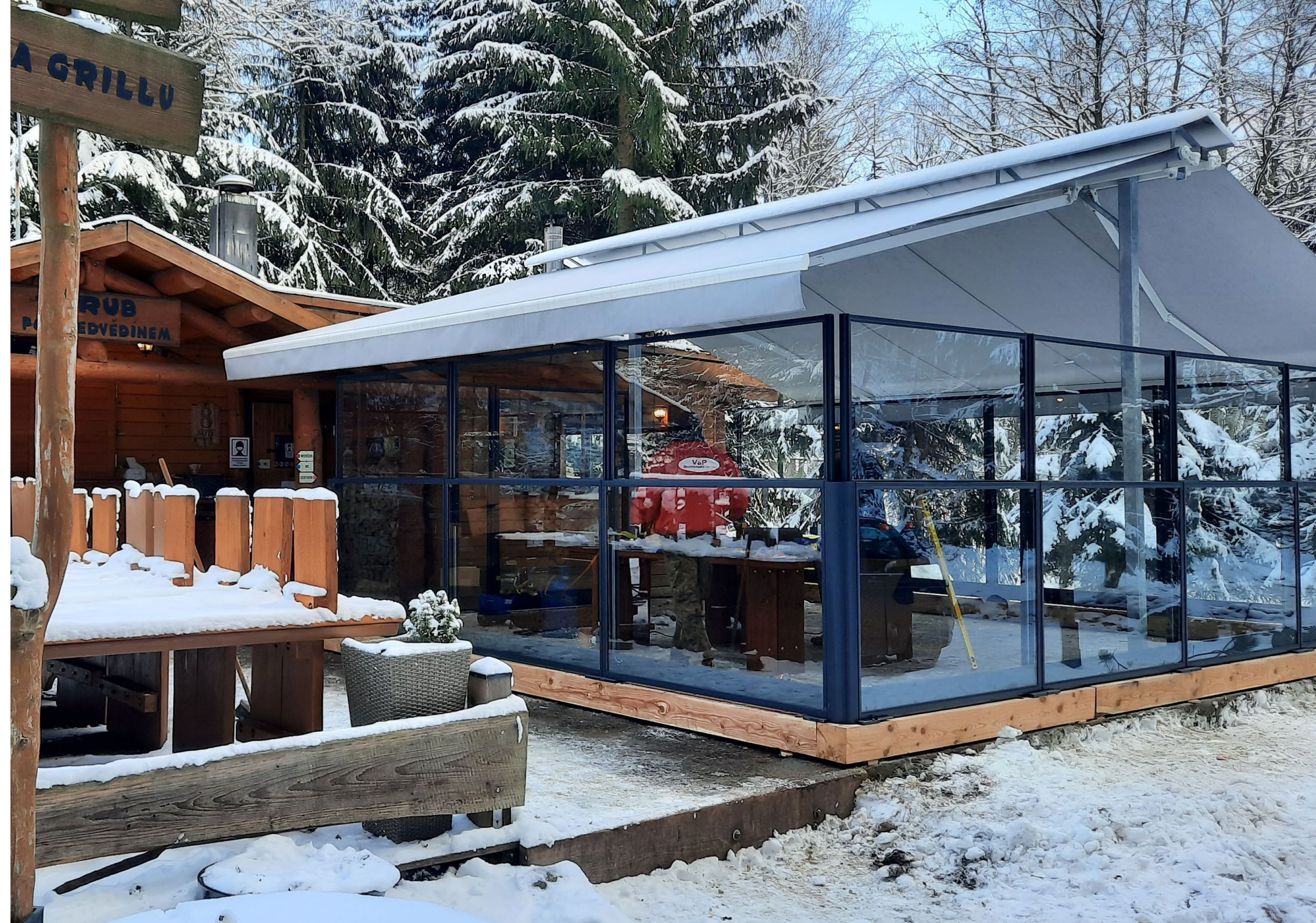
Height Adjustable Glass Balustrade

The panel is 110 cm height when it is closed. It rises up to 1 3'-7" height with very simple touch. Also descends down with very simple touch.