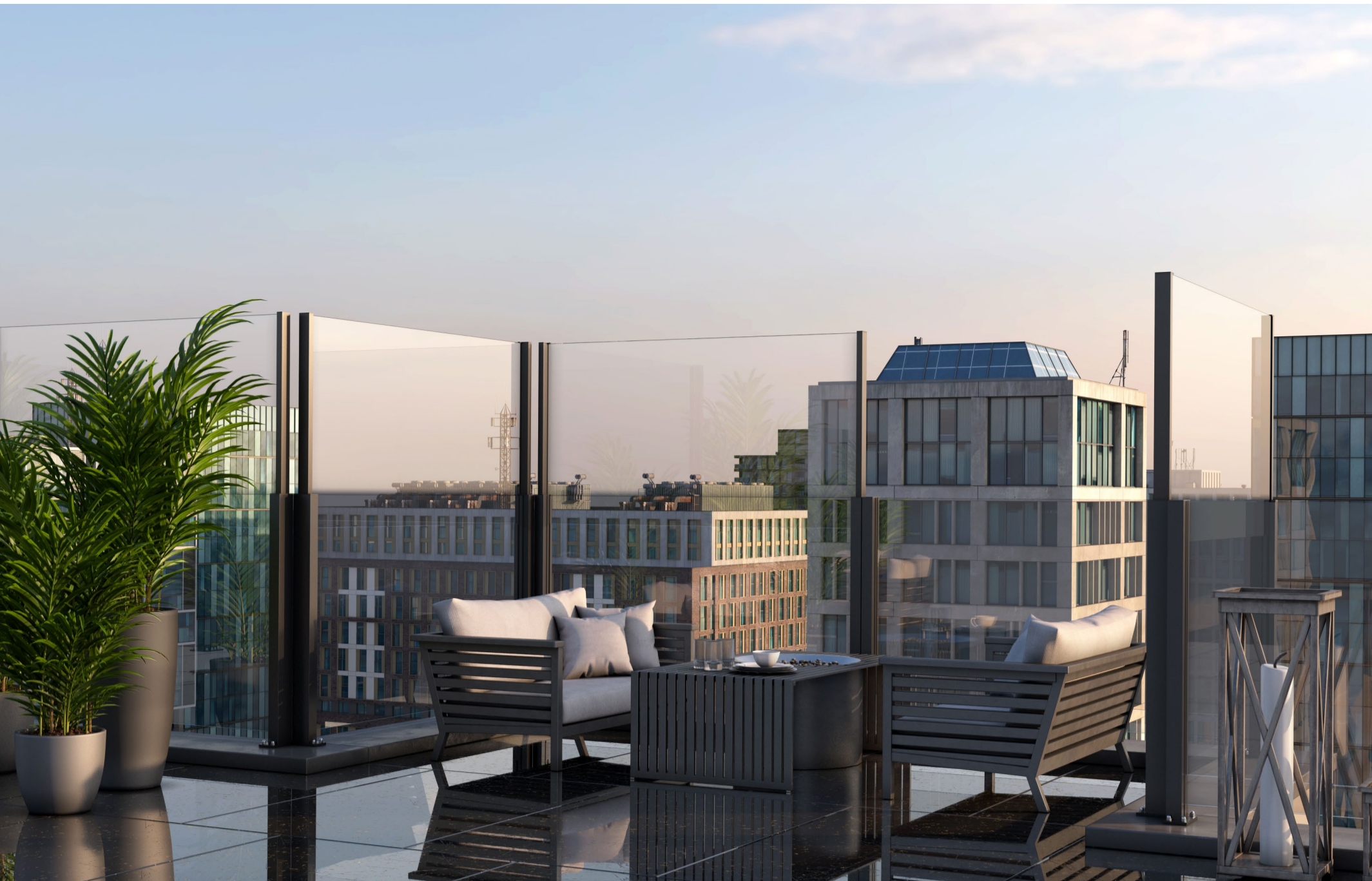
Height Adjustable Glass Balustrade